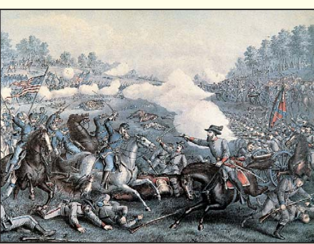
Third Battle of Winchester, September 19, 1864.

In the spring of 1864, Union commander-in-chief Gen. Ulysses S. Grant launched simultaneous attacks against the Confederates throughout the South. He accompanied Meade's army in Virginia during the bloody Overland Campaign battles of the Wilderness, Spotsylvania Court House, and Cold Harbor, maneuvering Lee ever closer to Richmond and finally besieging him