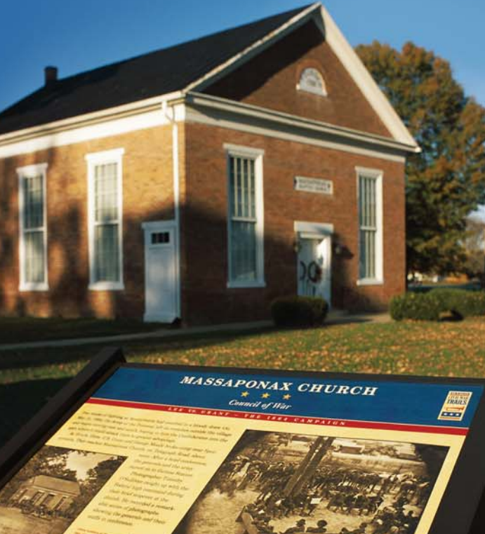
Massaponax Church, Baltimore, Md.